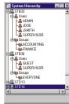
SYSCON for Windows

software updates that have been created for NetWare 3.12 to simplify administration. It features new administration utilities including a Windows-based SYSCON tool, up-to-date client software, and updated LAN, WAN and disk drivers—all in one convenient package. And, using the Remote Management Facility, you can save time and money by managing remote servers from your own workstation. This means you'll never have to take a server out of operation. So not only will you decrease network downtime, you'll receive powerful networking tools that make your network much easier to manage.